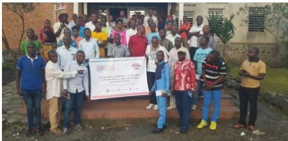
Goma group photo