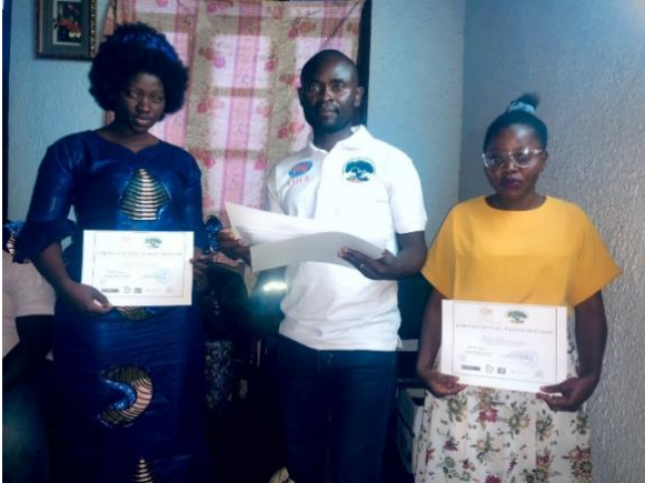
PADS Coordinator handing certificates