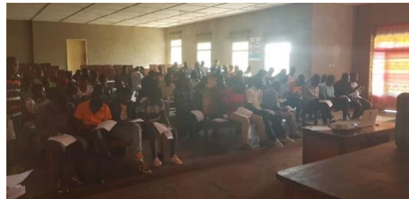
Sake auditorium (from front of the room)