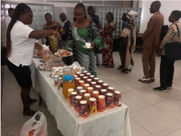
Food service in Kinshasa