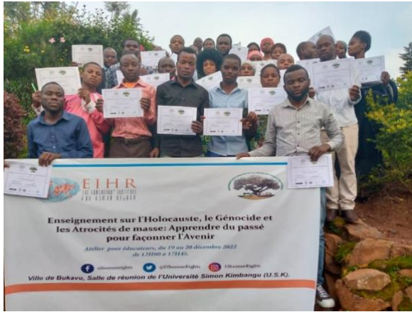
Group photo in Bukavu