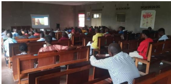
Sake auditorium (from back of the room)