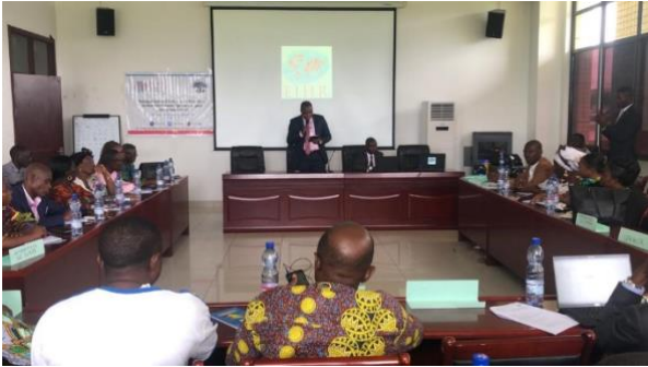
Opening remarks Ministry of High Education Rep.